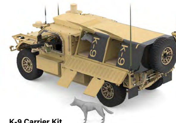
K-9 Carrier Kit Carries four canines and three-man crew