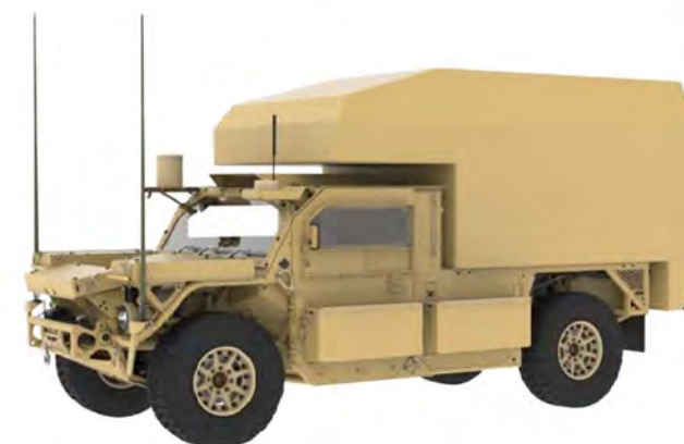
Shelter Carrier Kit Ambulance or C4 Shelter

Manned or remote weapon station capable from 7.62mm to .50 caliber armament