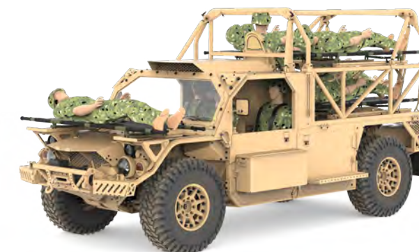
Tactical CASEVAC/Ambulance Kit Carries up to four litters and three operators in cab