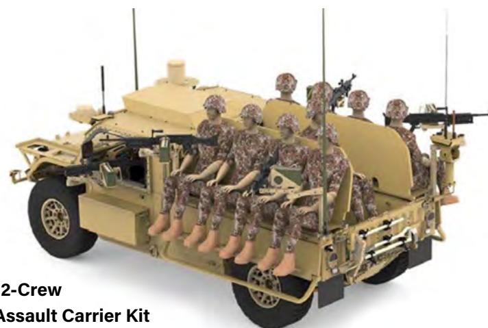
12-Crew Assault Carrier Kit Carries nine seated operators in cargo bed, three in cab